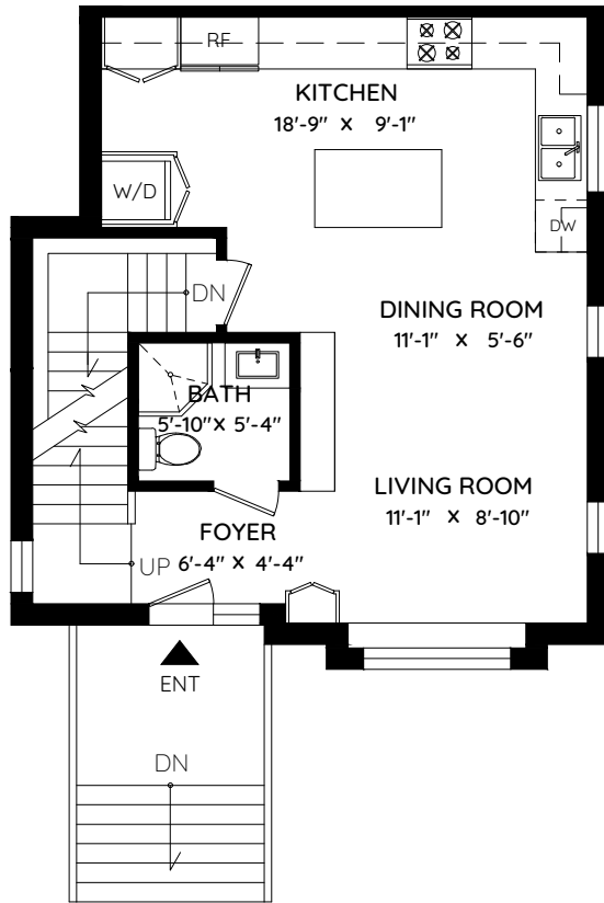
MAIN FLOOR 539 SQ.FT. CH: 9'-0"